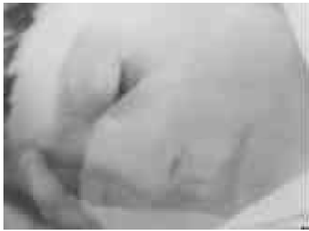
Her Glacial Soeed