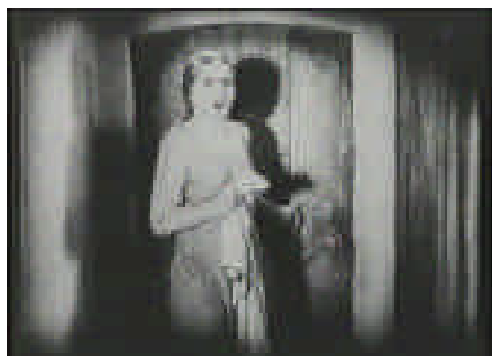
Film ist. 7-12

Liliana Porter US/AR 16mm/vid. col. snd. 19' 00 winner: Honourable Mention